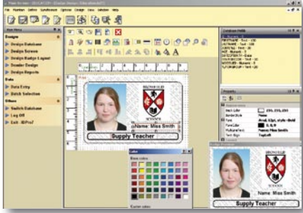
Image shows the IDPro7 card design feature

IDPro allows multiple card types to be produced from the one installation