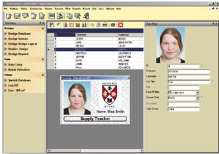
Image shows the IDPro7 batch selection feature

At Payne Security our experience with IDPro and the requirements of the education sector mean we understand what you need and will work with you to design, create and support an ID card system relevant for your educational establishment.