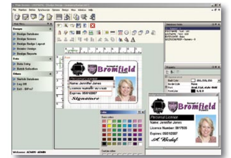
Image shows the IDPro7 card design feature

IDPro allows multiple card types to be produced from the one installation