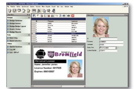
Image shows the IDPro7 batch selection feature

At Payne Security our experience with IDPro and the requirements of the public sector mean we understand what you need and will work with you to design, create and support an ID card system relevant for your organisation.